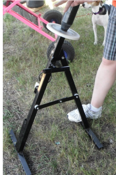
Option B (Shorter User)

Stand in front of changer, support plate facing body. Place 1 or 2 feet on the changer's horizontal legs.