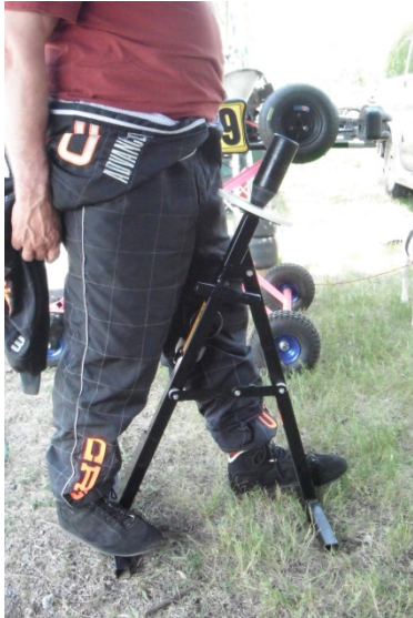
Option A (Taller User)

Stand behind the change; support plate facing away from body. Place 1 or both feet on the horizontal changer legs.